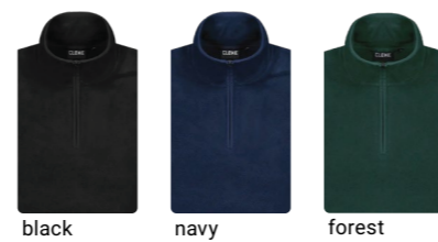
black navy forest