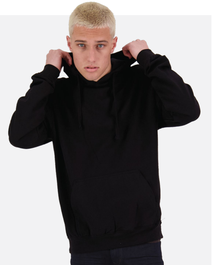
TEAR-AWAY NECK LABEL